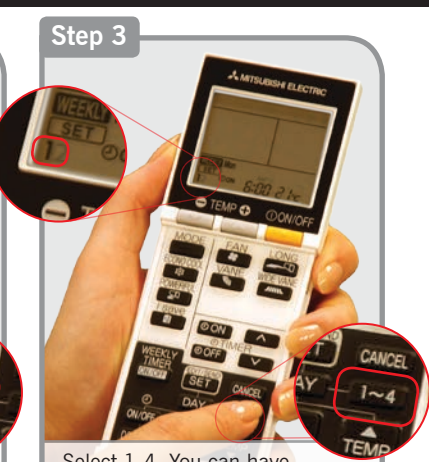
Select 1-4. You can have up to 4 settings per day. Make sure 1 is selected to enter your first setting of the day.