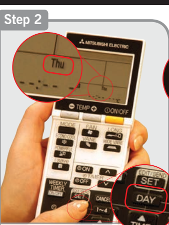
Select Day (Mon-Sun). Thursday is selected in the example above.