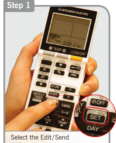
SET button to start setting your timer patterns.

Point the remote at the heat pump until the "sending" logo disappears.