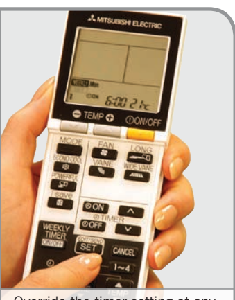
Override the timer setting at any time by pushing any button on the remote.

Please Note - If left idle for 30 seconds the 7 day timer programming system will reset.